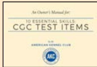
10 ESSENTIAL SKILLS: CGC TEST ITEMS