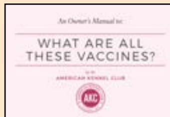
WHAT ARE ALL THESE VACCINES?