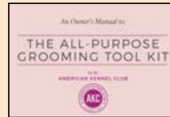
THE ALL-PURPOSE GROOMING TOOL KIT