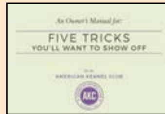
FIVE TRICKS YOU'LL WANT TO SHOW OFF