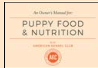
PUPPY FOOD & NUTRITION