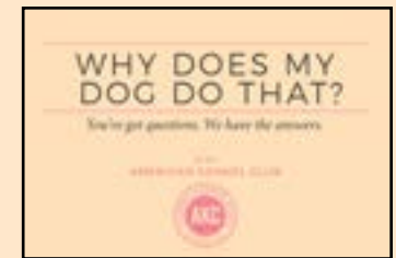
WHY DOES MY DOG DO THAT?