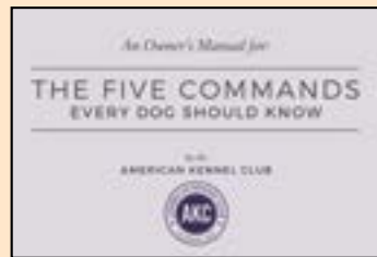
THE FIVE COMMANDS EVERY DOG SHOULD KNOW

We hope this information was valuable to you in helping your puppy live a long, healthy, happy life. Below, find additional books in our Owner's Manual series designed to strengthen the bond between you and your furry family member.