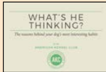
WHAT'S HE THINKING?