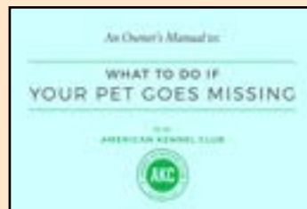
WHAT TO DO IF YOUR PET GOES MISSING