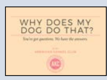
WHY DOES MY DOG DO THAT?