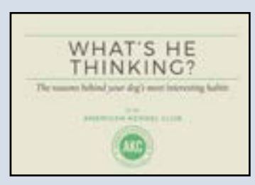
WHAT'S HE THINKING?