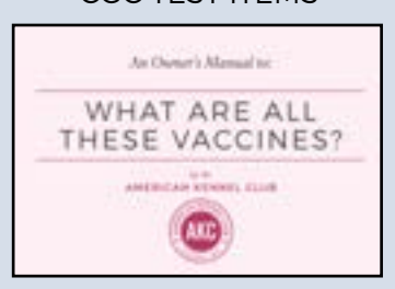
WHAT ARE ALL THESE VACCINES?