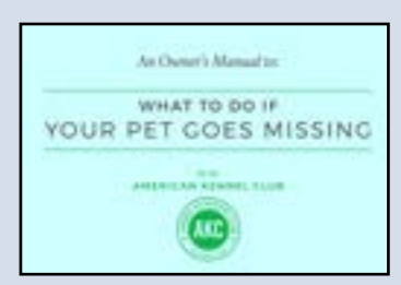
WHAT TO DO IF YOUR PET GOES MISSING