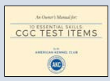
10 ESSENTIAL SKILLS: CGC TEST ITEMS